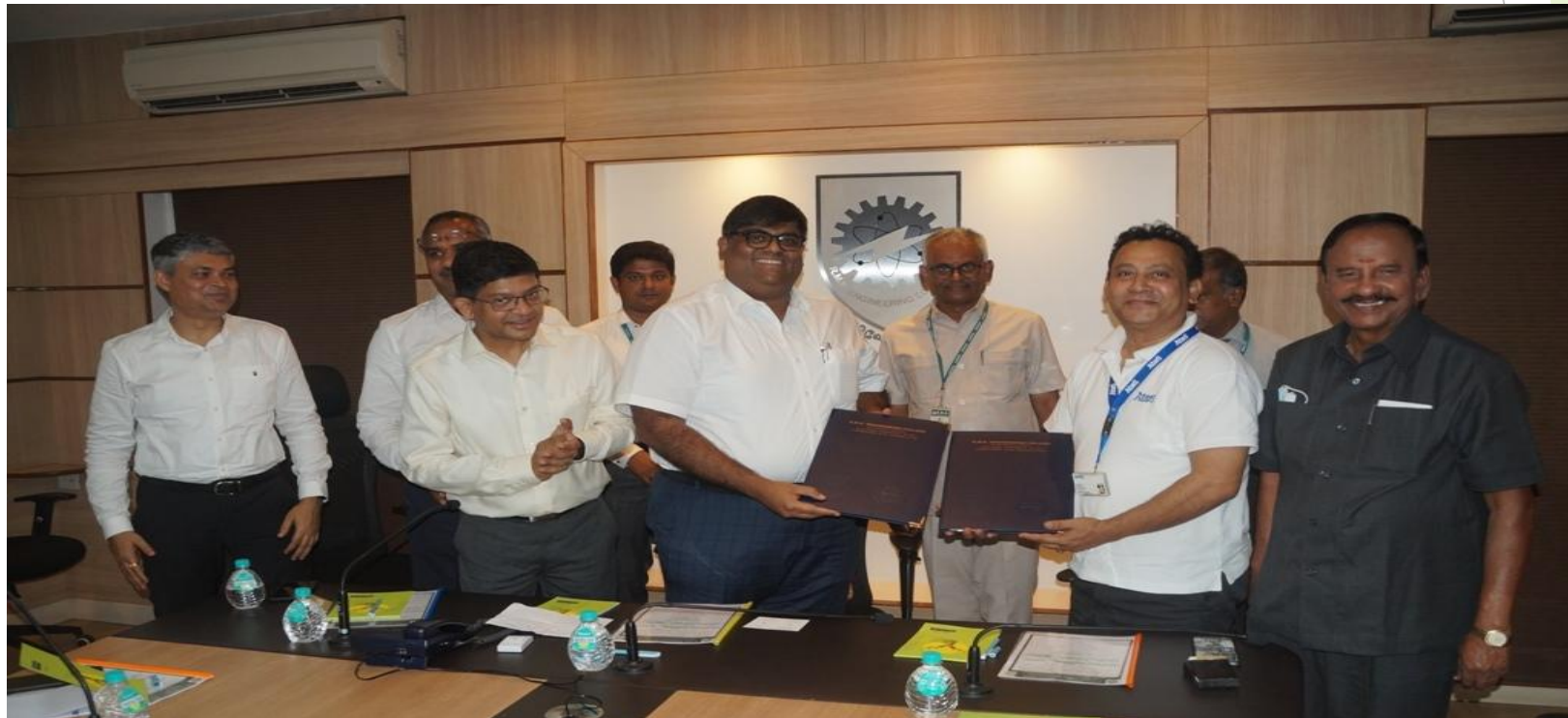
Exchange of MoU with Atos on 18.05.2023

R.M.K. Group of Institutions signed the Memorandum of Understanding with the Atos Global IT Solutions as Knowledge partner for CSE Batch Adoption on 18-05-2023