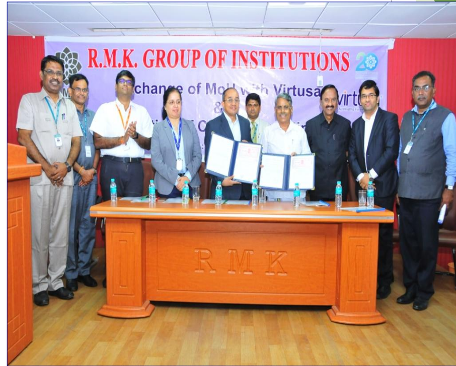
Inauguration of Cloud Computing CoE Lab & Exchange of MoU with Virtusa on 13.03.2018